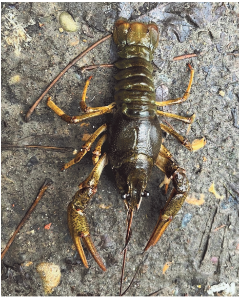
Adult Turkish crayfish can reach between 15cm and 30cm in length and their colour can range from pale yellow to dark green depending on environmental conditions.

detrimental effects on sensitive aquatic ecosystems. Within Keston Ponds, their presence may contribute to competition with fish for food resources, interference with angling activities through bait removal, and potential declines in fish recruitment due to habitat degradation. While Turkish crayfish could outcompete the native white-clawed crayfish ( Austropotamobius pallipes ) if their ranges were to overlap, they are not known to carry crayfish plague, a disease that has severely impacted native populations.