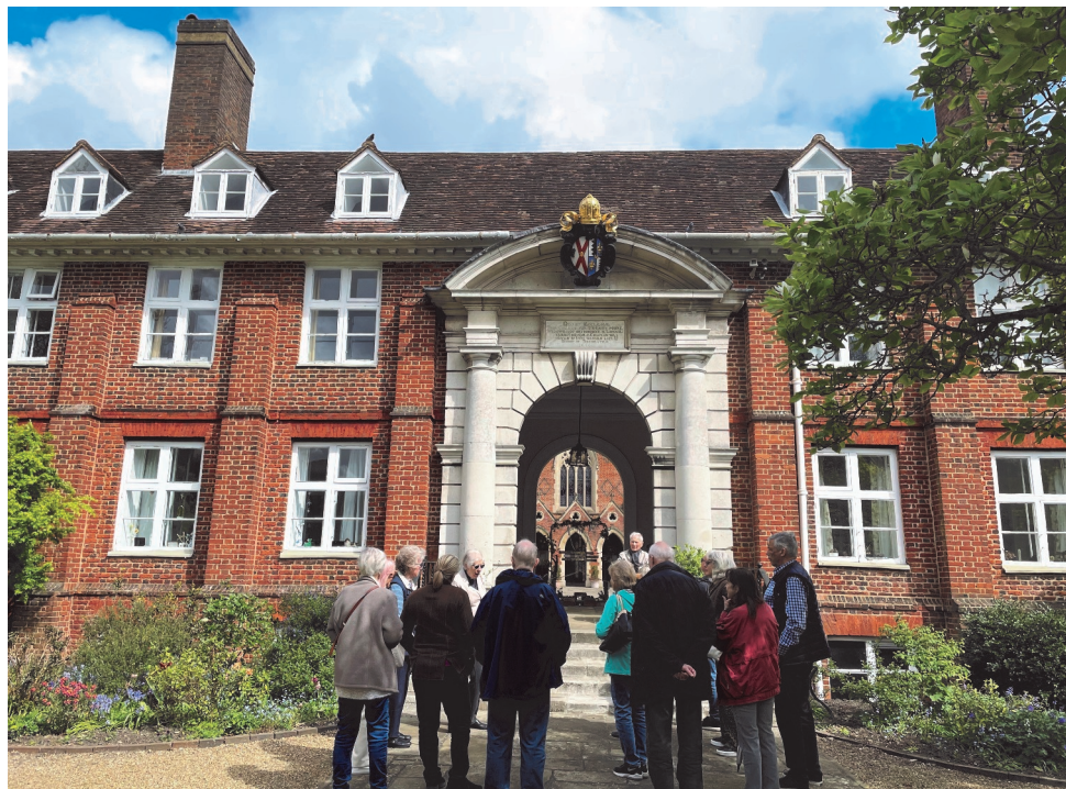
Entrance to Bromley College from London Road