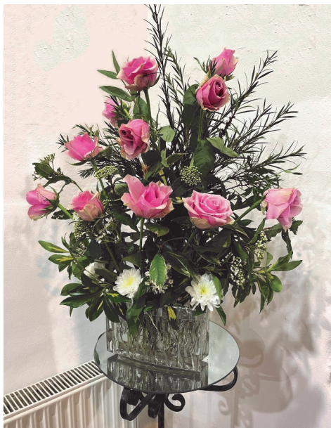
Keston Church flower arrangement without use of oasis

The Guild of Church Flower Arrangers are coming to Keston Parish Church for one night only – Monday 1st June at 7.30pm. The Guild started in 1966, and they are an ecumenical group which visits many churches around Bromley, where experienced demonstrators create beautiful floral designs suitable for worship spaces.