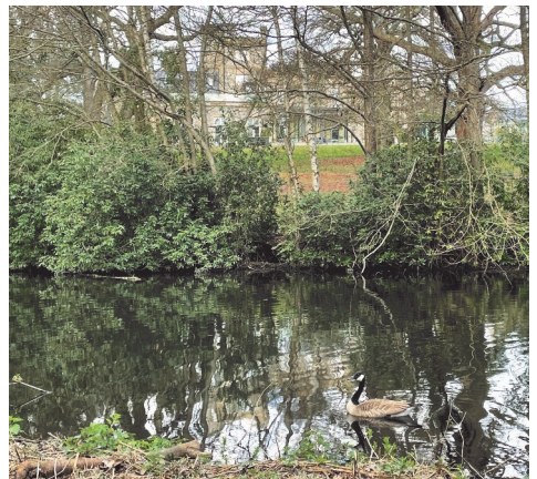
Ravensbourne House and Pond 4 today