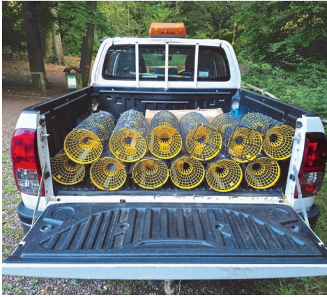
Traps supplied by Environment Agency team

As part of the Keston Ponds restoration project aimed at improving water quality, enhancing biodiversity, and restoring riparian habitats, a series of ecological surveys was undertaken to investigate the crayfish population long reported within the site.