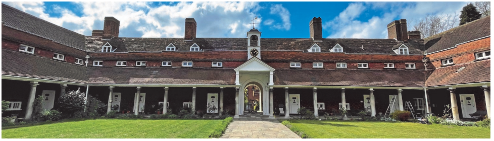
The Wren Quad, with clock tower. The 36 Doric columns almost certainly came from the Royal Exchange destroyed in the Great Fire of London. Blackened fire damage can still be seen on them.

attic, whose duties included getting the water from the pump and fetching in coal.