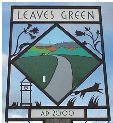
Photo of sign in 2023