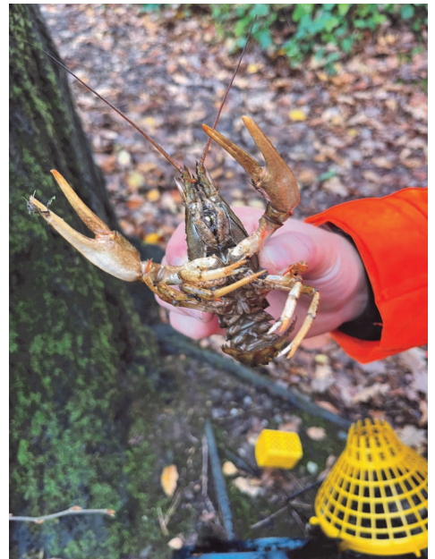
Crayfish claws are smaller and more even than those of their relatives, lobsters

As omnivorous organisms, Turkish crayfish feed on aquatic plants (macrophytes) and invertebrates, and high population densities can have