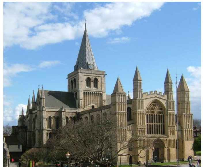
Virtual Tour of Rochester Cathedral

https://www.rochestercathedral.org/virtual-tour